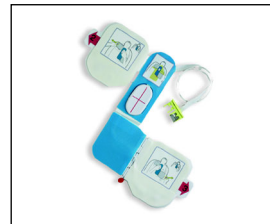
CPR-D•padz offer clear anatomical placement illustrations and a CPR hand-positioning landmark.

The unique one-piece design of ZOLL's CPR-D•padz addresses these problems by orienting the simple design to the head while using the easily remembered CPR landmark (the sternum) as the key placement cue. Packaging is then removed by a simple pull after positioning. Because this is the same placement taught for CPR hand position, AED users benefit from having to remember only one easy landmark for both interventions.